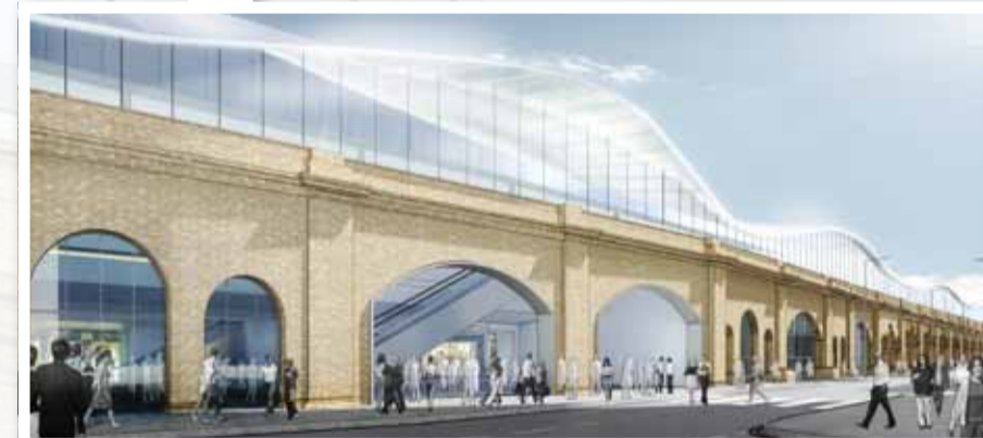
View of the new St Thomas Street entrance from the West