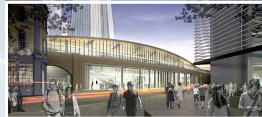
View of the new Tooley Street entrance

With entrances on Tooley Street and St Thomas Street, connections to and between the surrounding areas will be improved, helping to regenerate the area. Tube and bus links will be improved and lifts and escalators will provide step-free access to every platform.