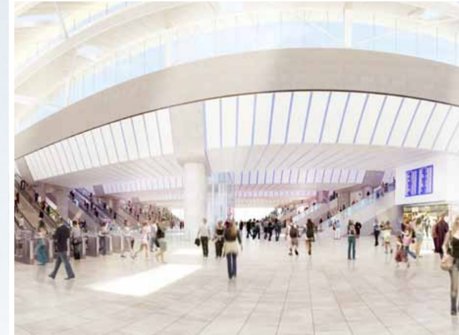
View of new station concourse