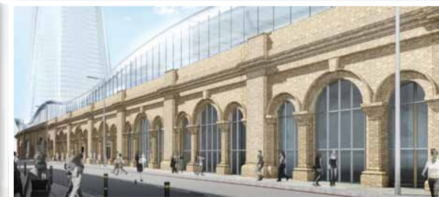
View of St Thomas Street from the East