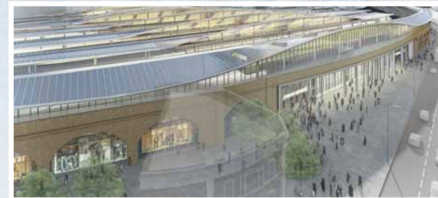
Aerial view of London Bridge station (Shipwrights Arms faded for image purposes only)